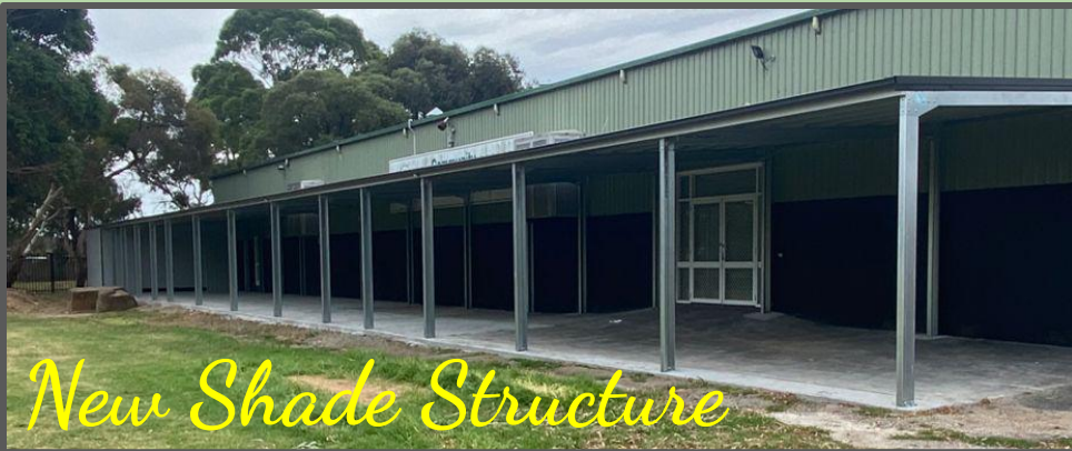
New Shade Structure

The new, school shade structure located at the back of the gym has now been completed. This undercover area will provide a shaded learning space for our students to use as well as a protected area for play on hot days.!